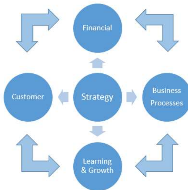
Figure 1: BSC Perspectives(Kaplan, 2010)

In the past, performance management system mostly only consider about the financial perspective, but BSC not only measure through the financial perspective but also stakeholders, internal process and learning and growth of the company. BSC framework is depicted in Figure 1.