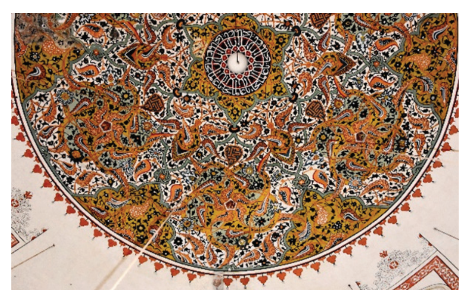
Figure 4: Dhikr Square Dome Detail

There are two kinds of decorations on the windows for lighting on the foot of the dome. The patterns of these window borders and window tops, which were probably left unfinished, are quite distorted. In some of the windows, the background of the borders is colored brown and the rûmî motif pattern is colored white. However, on the other part of the windows, there is no brown background color, only a rûmî motif