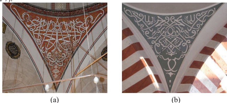
Figure 7: Jeli Thuluth Inscriptions on the Pendentive Surfaces of Dhikr Square (a) and Edirne Üç Şerefeli Mosque Dome (b).

In the upper corners of the triangular composition, the "ayn – \xi " letters of the name "Omer" are symmetrically facing each other, unlike the upper sides of the letter called the ayın kaşı. The space is completed by using the name "Muhammad" symmetrically in the middle part. In some places, ornamental signs were used, and the writing was applied in white on an orange background. The closed areas inside the letters are black. On the background of the text, there are light orange rûmî with green gradients. This area is surrounded by adjacent white, green, and orange contour lines. A similar design is found in the courtyard of Edirne Üç Şerefeli Mosque, on the pendentives of the east entrance dome. As the designs of both buildings were similar, the repair styles were also similar and lost their original form with a bad repair (Figure 7).