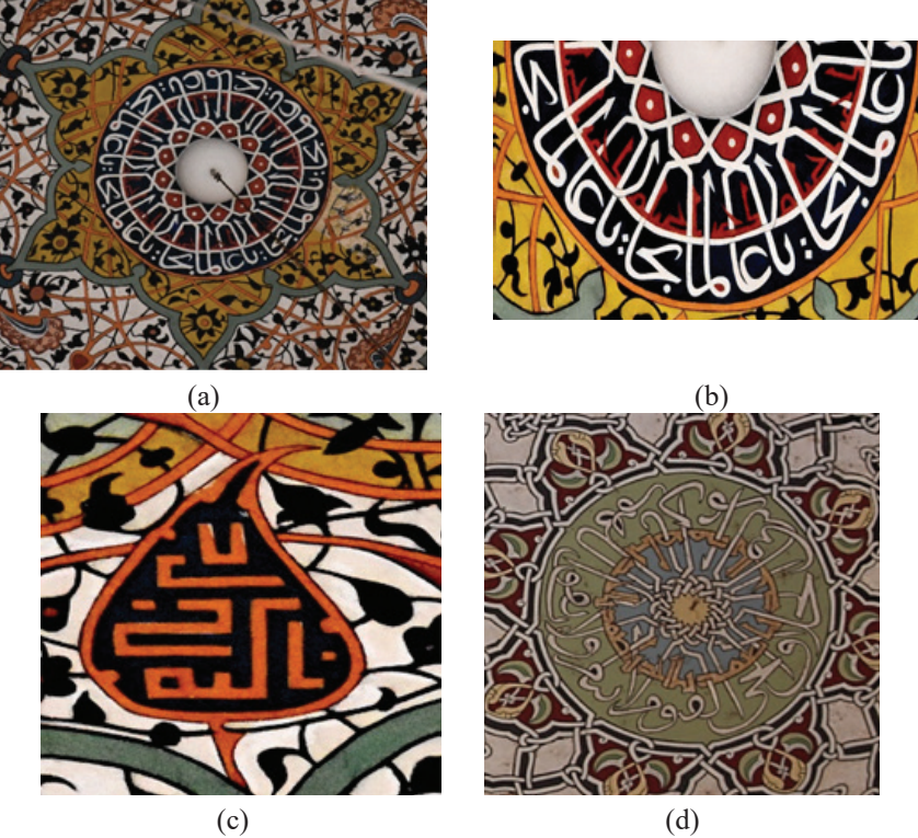
Figure 2: Dhikr Square Dome (a.b.c) and Edirne Üç Şerefeli Mosque (d) Dome Inscriptions Details

There are texts created with square kufic script writing in the drop forms on the ends of the six-pointed star-shaped decoration in the dome design. The texts in these pear-shaped forms are "mubarak bâd" writings.