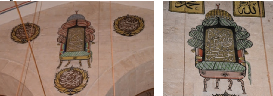
Figure 8: Caligraphy and Paintings on the Wall Surface in Dhikr Square

The writing and armchair painting on the arch triangles area is a 19th century work and does not comply with the main composition of the dhikr square section. In fact, here is the signature of Naqqash Calligrapher Mahbub Efendi dated 1888 (Figure 8).