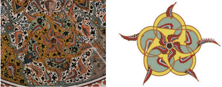
Figure 3: Dhikr Square Dome Design Rotational Symmetry Form Drawing 1. Rotational Symmetry Form

On the other hand, in the continuation of the drop shapes, the form shaped with rûmî motifs the most striking point of the design. This pattern, arranged in the style of rotational symmetry form, has an image that breaks the symmetry of the main composition, and a different version of it is located on the dome above the exit door of the Üç Şerefeli Mosque in the north direction of the courtyard. The artist has created a special fiction here. He created an original design by using rûmî motifs and using the strip motifs of the period (Figure 3), (Drawing 1).