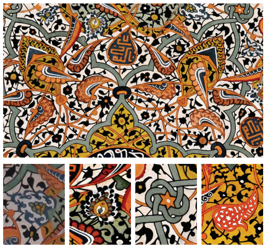
Figure 9: Detail From The Rûmî, Hatâî and Knot Motifs in The Dhikr Square Evaluation

used expertly. While the munhani motifs are preferred especially within the structure of rûmî motifs, it is possible to see the applications of the strip motifs specific to this period in different designs. As mentioned above, there is a design that we do not come across and cannot see in all of the dome decoration, before the Seljuk decoration and then in the classical Ottoman decoration (Figure 9).