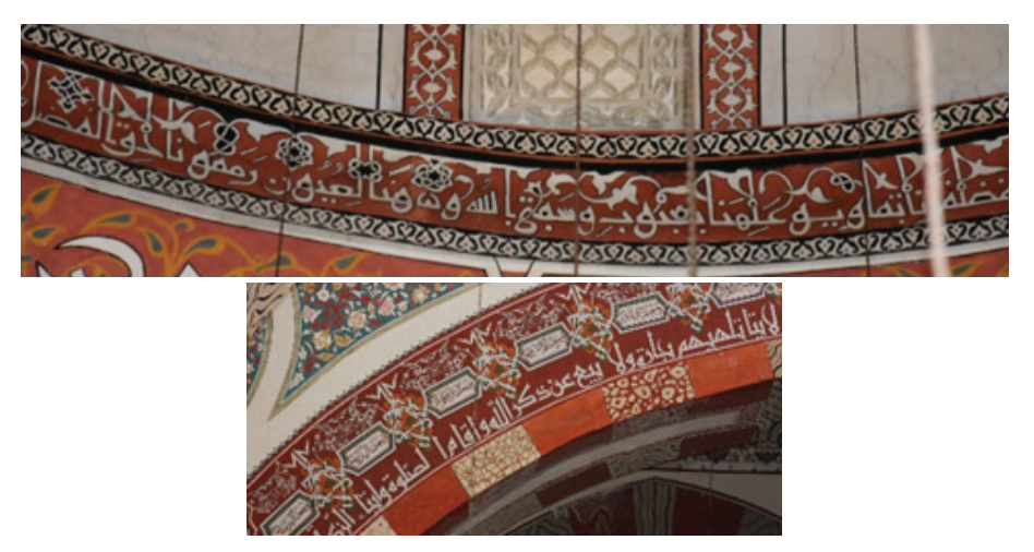
Figure 6: Drum of Dhikr Square and Arch Inscriptions of Edirne Eski Mosque 2.2. Pendentive

The names "names of Allah (lafza-1 Celâl), names of Prophet (ism-i Nebî), names of Sahabahs (cihâr-1 yâr-1 güzin)<sup>9</sup>" with symmetrical design are applied in triangular compositions on orange background on the huge pillars carrying the dome, on the four pendentive surfaces that provide the transition to the dome. Letters are used in unusual forms in the design.