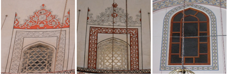
(a) (b) (c) Figure 5: Dhikr Square (a,b) and Window Surround Decoration of Sultan Selim Mosque (c)

The floor of the triangle shaped sheet above the windows is orange in some windows and colorless in others. While the background of four opposite window decorations is orange, the background of the other four is white. These patterns, which are an application other than the general composition, must have been copied from the window borders of the Sultan Selim Mosque (16th century), next to the Dervish Convent, during the repair process. But the practice is pretty bad (Figure 5).